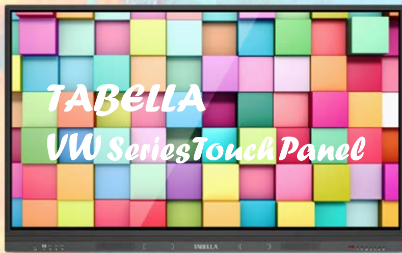
Tabella intelligent panel will adjust brightness automatically by detecting the movement of users close to the screen, thus provides you a smooth and comfortable writing experience.

The smart Eye-Comfort solution can function intuitively with the help of the embedded sensor.