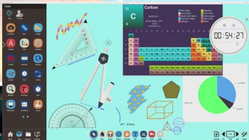
TABELLA supports multi-touch capability up to 20 points, allowing more students to participate in discussion and highly engaging activities at once.