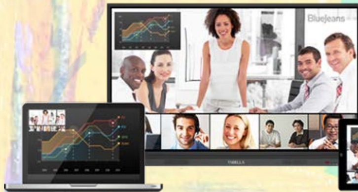
Tabella is designed to be flexible and works with your existing Video Conferencing solutions and software.

The open platform approach and embedded Windows OS (with optional OPS Module installed) gives you access to cloud-based applications such as Zoom, Skype, Google Meet, BlueJeans, MS Team and Cisco Webex etc..