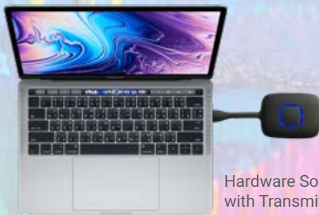
Hardware Solution with Transmit Dongle

Multiscreen function creates a collaborative and interactive atmosphere in the meeting room. Only few steps to lecture, present, collaborate and share brainstorming ideas by casting the devices wirelessly